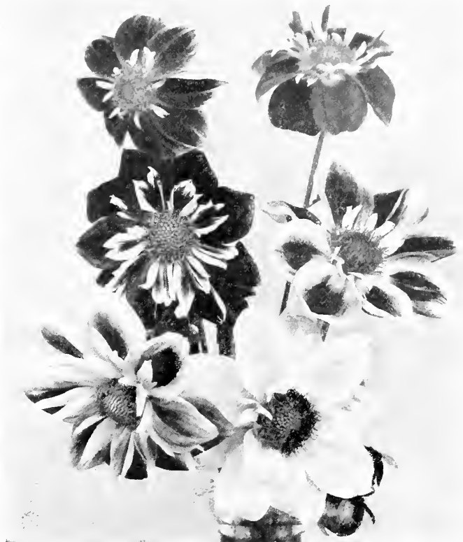
Atglen Allston Century